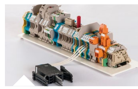
Terminal blocks contain springs made of high-performance alloys, such as Wieland-K55 R800