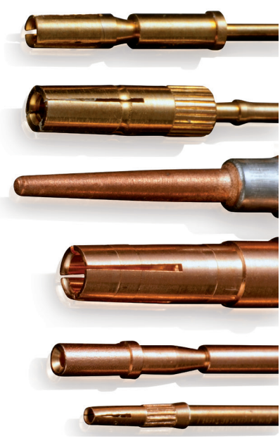
Different types of connectors

All of the WICONNEC materials offered meet the requirements of current directives, such as RoHS (Restriction of Hazardous Substances) and the ELV (End of Life Vehicle) directive.