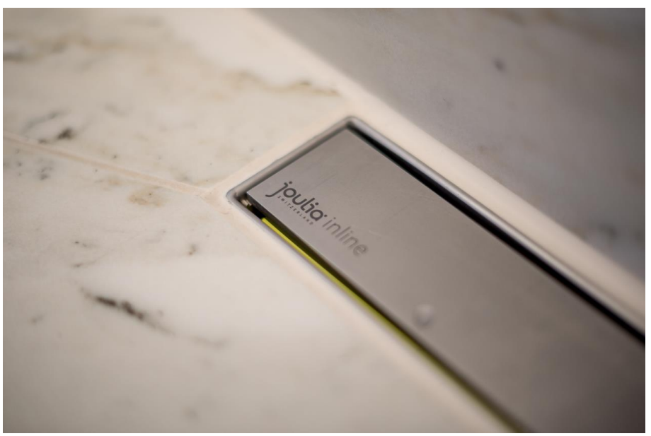
Joulia shower drain channel