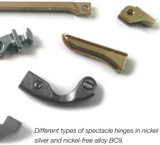
Different types of spectacle hinges in nickel silver and nickel-free alloy BC9.