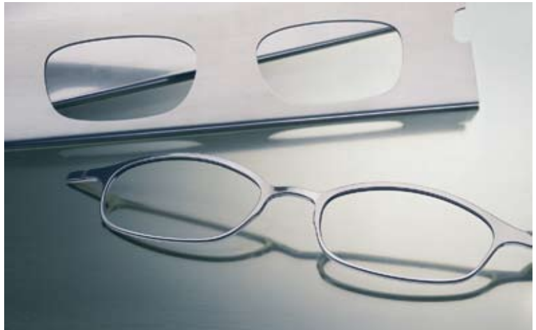
In a milling operation Wieland sheets can be processed into frames.

These materials enable manufacturers to produce high-grade, absolutely nickel-free spectacles.