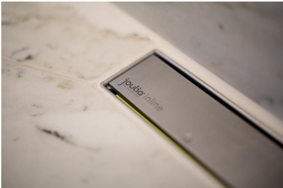
Joulia shower drain channel